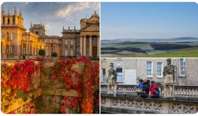
Lenheim Palace and 2 others