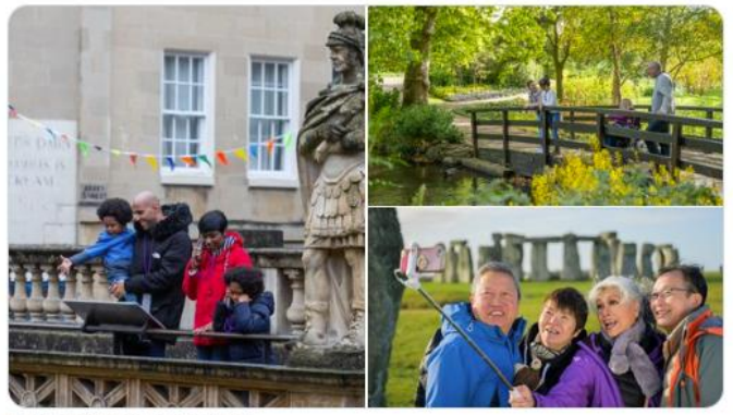
Stonehenge and 2 others