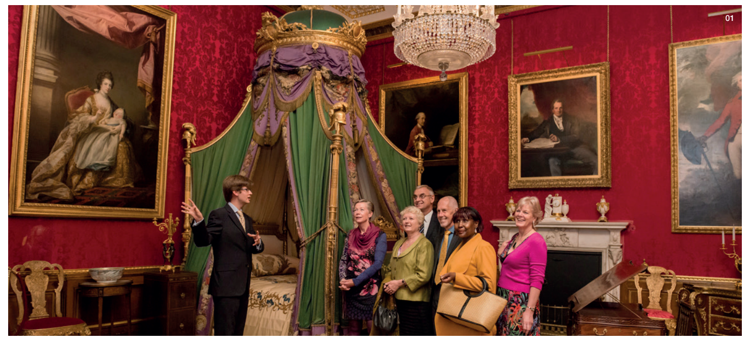
01 Private Tour in King's Bedchamber02 Theatre Royal Windsor