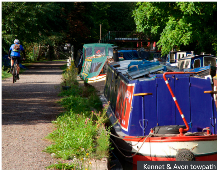
Kennet & Avon towpath

Follow the Kennett & Avon Canal towpath all the way from Bradford on Avon to the market town of Devizes. The route is 12 miles of traffic-free cycling with boatyards and canalside pubs en route. Heading east from Bradford on Avon , you pass Trowbridge and Hilperton and then Semington. Then continue past Seend Cleeve and Martinslade before arriving at the stunning Caen Hill Locks - a spectacular set of 29 locks enabling boats to get up and down the waterway; it's one of the greatest examples of canal engineering in England. Shortly after passing the locks you come in to Devizes where you can stop at Devizes Wharf for a slice of homemade cake at the tea room or for something more substantial head to The Peppermill on St John Street for first-class British cuisine - there are six bedrooms here, should you wish to stay over, alternative you then cycle back to Bradford on Avon. Overnight Dine at The Boat House then spend the night at Woolley Grange , a beautiful Jacobean manor-turned-hotel just on the outskirts of Bradford on Avon.