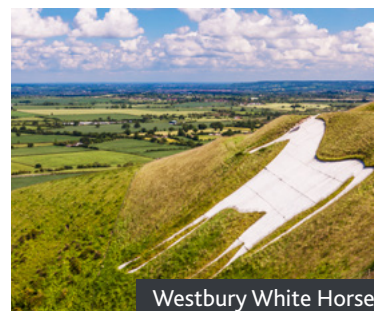
Westbury White Horse

This is the longest ride of the three days - a round trip of almost 40 miles (62km). Head east along the Kennet & Avon towpath to Staverton then head over for a coffee at the Field Kitchen , Holt and pop into the National Trust's Courts Garden . Then continue for 6 miles to Seend Cleeve for lunch at The Brewery Inn or The Barge Inn and then head south across the A361 (one of the main 18th-century roads between London and Bath), as you head to Salisbury Plain - one of the great wilderness areas of southern England. You'll ascend the ridgeway at Great Cheverell and then follow the gravel track of Imber Range Perimeter Path for 8 miles to Bratton Camp and the Westbury White Horse before a long descent to Upton Scudamore then to Farleigh Hungerford and the final descent to Bradford on Avon. Overnight For somewhere completely different, stay at The Farm Camp's bell tents and toast marshmallows under the stars.