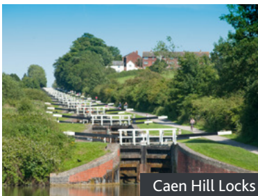
Caen Hill Locks

Follow the Kennett & Avon Canal towpath all the way from Bradford on Avon to the market town of Devizes. The route is 12 miles of traffic-free cycling with boatyards and canalside pubs en route. Heading east from Bradford on Avon , you pass Trowbridge and Hilperton and then Semington. Then continue past Seend Cleeve and Martinslade before arriving at the stunning Caen Hill Locks - a spectacular set of 29 locks enabling boats to get up and down the waterway; it's one of the greatest examples of canal engineering in England. Shortly after passing the locks you come in to Devizes where you can stop at Devizes Wharf for a slice of homemade cake at the tea room or for something more substantial head to The Peppermill on St John Street for first-class British cuisine - there are six bedrooms here, should you wish to stay over, alternative you then cycle back to Bradford on Avon. Overnight Dine at The Boat House then spend the night at Woolley Grange , a beautiful Jacobean manor-turned-hotel just on the outskirts of Bradford on Avon.