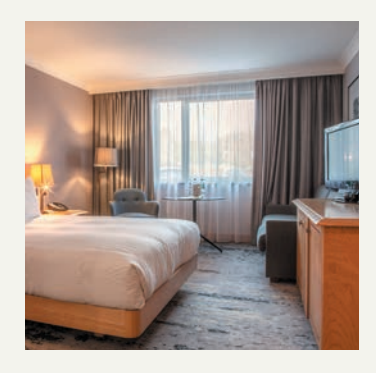
Doubletree by Hilton Swindon SWINDON SN5 8UZ doubletree3.hilton.com/ en/hotels/united-kingdom/ doubletree-by-hilton-hotelswindon-SWIHNDI/index.html (14 miles from Marlborough)