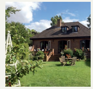
Meadowbank House B&B LIDDINGTON, SN4 0EY Meadowbankhouse.com (8.5 miles from Marlborough)