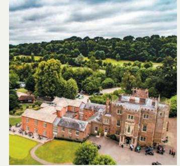
Donnington Grove Hotel NEWBURY RG14 2LA donnington-grove.com (9 miles from Hungerford)