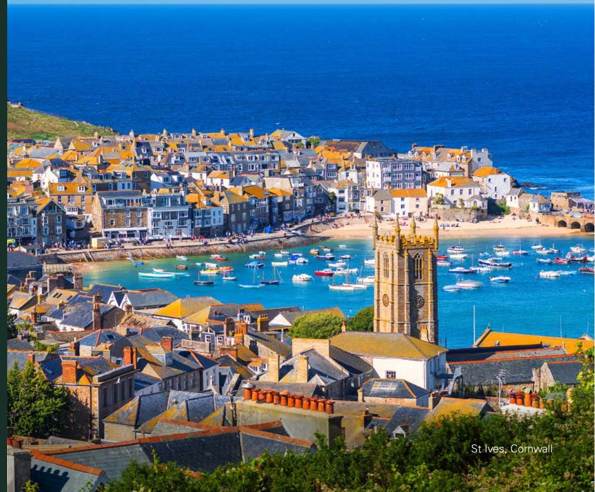
St Ives, Cornwall